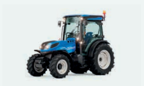
Vineyard & Narrow Operations From 1061mm to 2024mm width