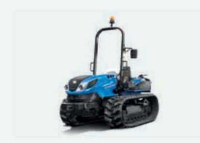
Orchard, Tree & Alpine Operations 45% maximum slope