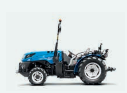
Low Canopy Operations 1.31m in top of the hood