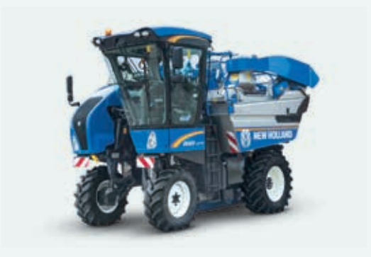
Harvesting From 0.90m between rows